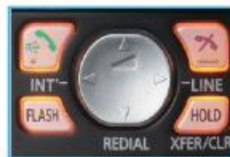
Easy Menu Operation