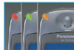
LED Call Indicators