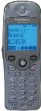
KX-TD7695 Compact Model