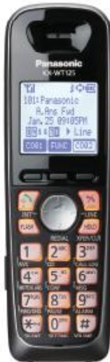
KX-WT125/126 Entry Model