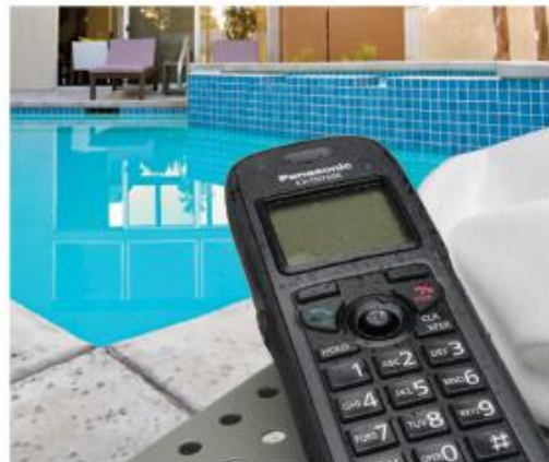
Dust & Splash Resistant