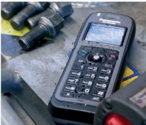
Shock-Resistant, Ruggedized Design

The KX-TD7696 boasts a large, 6-line, blue backlit LCD and includes all the features you'd expect such as Caller ID, personal and system speed dials and a built-in, 100-entry phone book and distinct ring/LED options. The handset includes an Intuitive Graphical Icon Menu and dynamic Operation Guidance with Soft Keys and a Built-In Joystick.