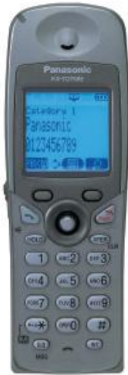
KX-TD7685 Standard Model