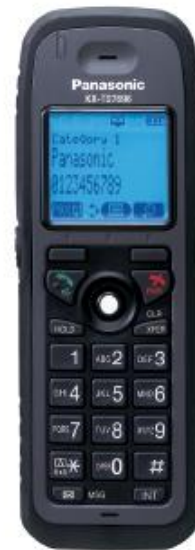
KX-TD7696 Ruggedized Model